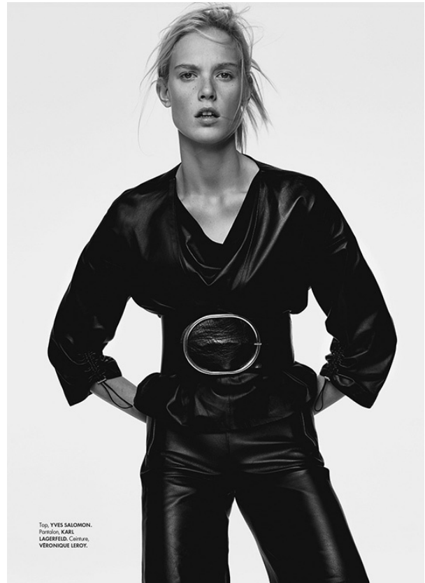
Top: YVES SALOMON. Pantalon: KARL LAGERFELD. Cinturino: VERONIQUE LEROY.