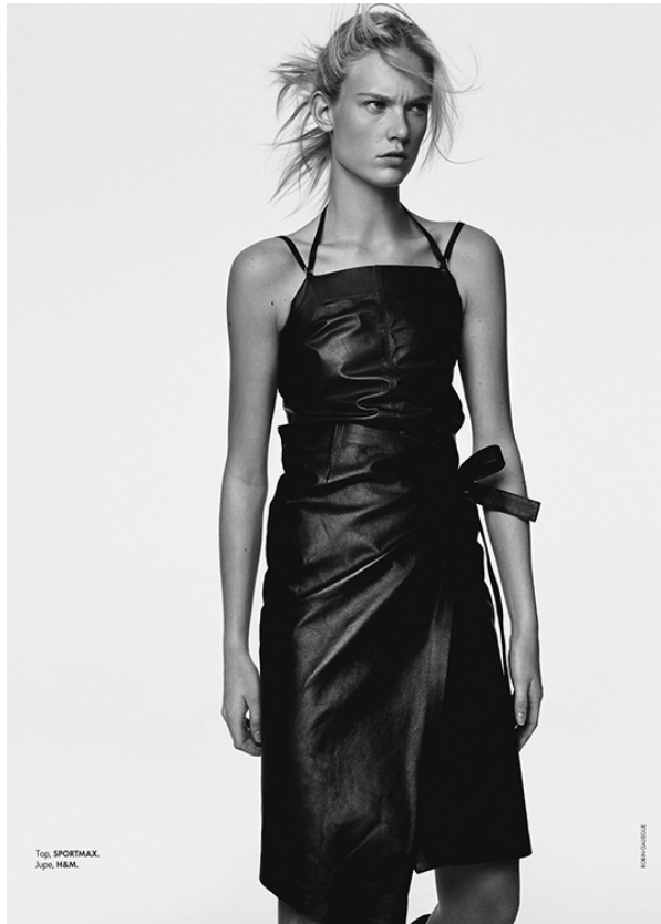
Top: SPORTMAX. Jeans: H&M.

HEIGHT 182 cm BUST/WAIST/HIPS 86/65/94 cm EYES blue green HAIR blonde SHOES 41 LOCATION Düsseldorf DE