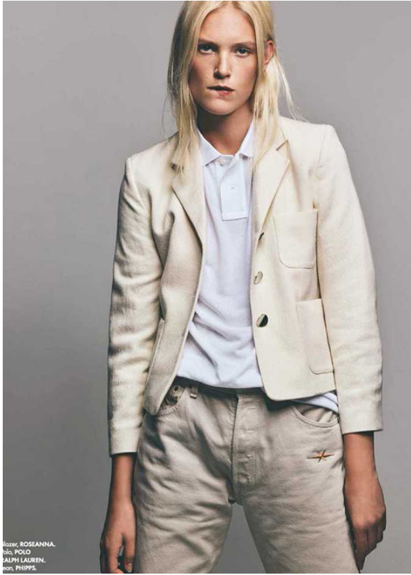
Blazer: ROSEANNA. Polo: POLO RALPH LAUREN. Trousers: PHIPPS.

HEIGHT 182 cm BUST/WAIST/HIPS 86/65/94 cm EYES blue green HAIR blonde SHOES 41 LOCATION Düsseldorf DE