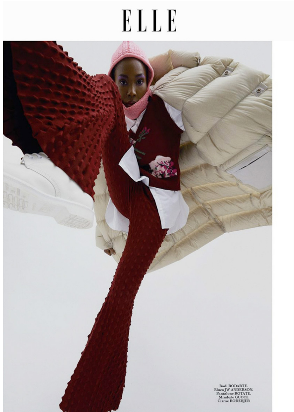
Modeli: IRENE C/O SPIN MODELS & LEANNE C/O CODE MODELS Kosa i sminkas: SABINE HOEGERL C/O NINA KLEIN AGENCY Styling: ANNE NEWMAN

HEIGHT 179 cm BUST/WAIST/HIPS 82/60/89 cm SIZE 34/36 JEANS 27/34 EYES brown HAIR black SHOES 40.5 LOCATION Hamburg DE