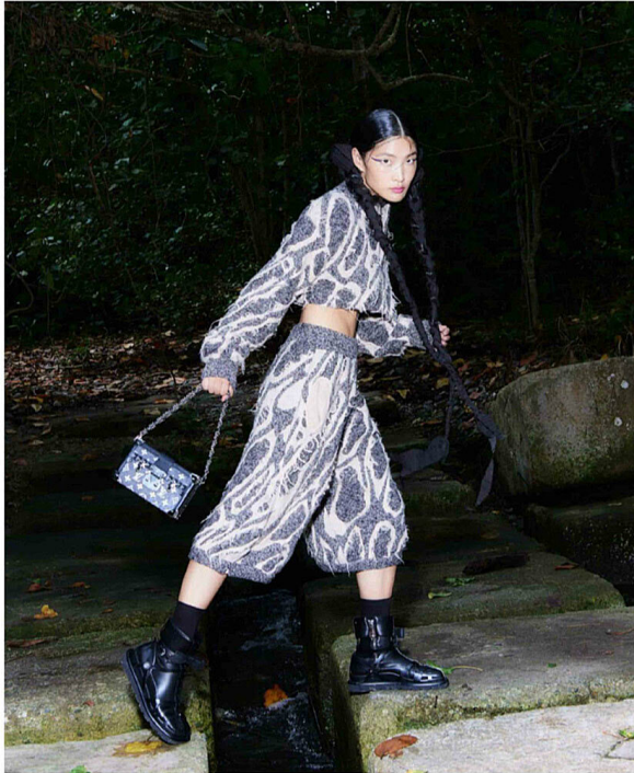
THIS PAGE Philtre , $1,187, paire , $1,429, Philo Mille Miglia , $3,622 and boots , $1,088 by LOUIS VUITTON. OPOSITE Blaise , $3,634, paire , $3,238, and boots , $1,088 by LOUIS VUITTON

HEIGHT 173 cm BUST/WAIST/HIPS 82/61.5/90.5 cm EYES brown HAIR black SHOES 39 LOCATION London UK